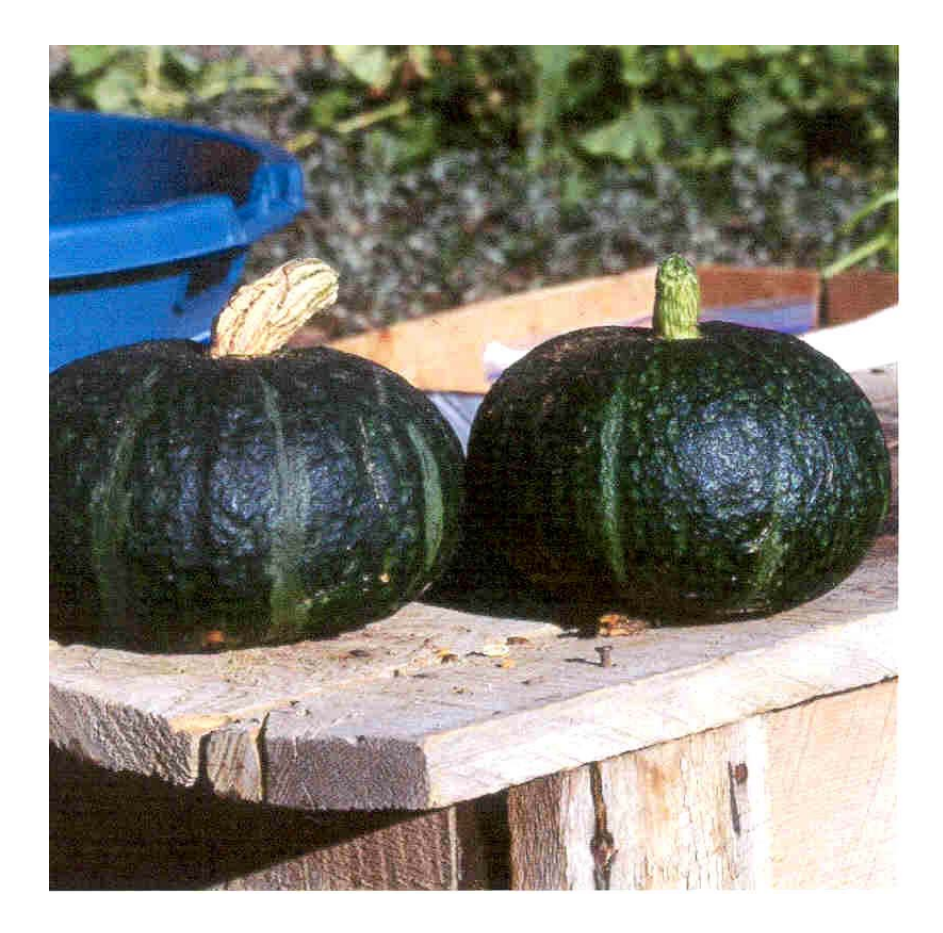
Figure 2: Kabocha squash on the left is mature (the stalk is shriveled and dry). The squash on the right is immature and would be considered non-marketable. The peduncle is still green.

Squash were harvested in the first week of September in 1998 and the second week of September for 1999. Harvest was not possible in 2000 due to the loss of irrigation water at the end of August. Squash were individually weighed and evaluated as marketable or non-marketable. Squash were considered non-marketable, based on the following criteria: 1) sunburn, 2) excessive scarring (scarring would include raised warts and ridges on squash surface), 3) too small (<2lbs), and 3) immature (immaturity was based on the greenness of the stalk (Figure 3). The Brix level (percentage of soluble solids which consist mostly of sugars) was taken from three squash randomly selected from each plot. The Brix levels were taken with a hand held refractometer (Atago Co., LTD., Tokyo, Japan).